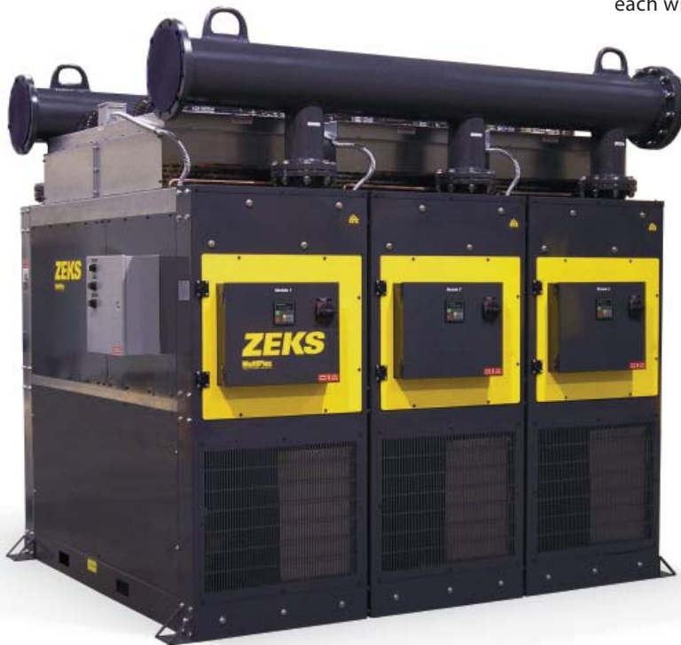
3-Module 7200HSFMA MultiPlex™ model with air-cooled refrigeration condensers and NEMA 1 electrical arrangement

The design enables users to maintain dryer operation even when one of the independent refrigeration systems is taken off-line for service or maintenance. Properly sized, the dryer outlet pressure dew point will not be compromised if a single module is de-energized.